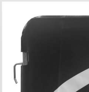
Rounded top corners.