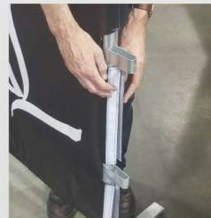
Full velcro side flaps.