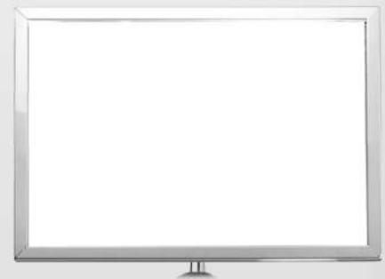
Horizontal 14" X 22" 355mm x 560mm