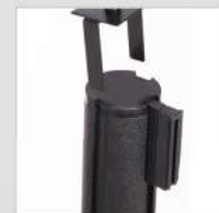
Adaptors to Fit All Major Stanchion Brands