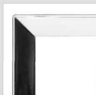
Steel Construction with 3/4"/19mm Border