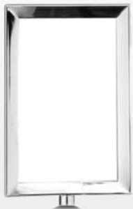
Vertical 7" X 11" 120mm x 200mm

Our Heavy Duty sign frames are manufactured with a 3/4"/19mm wide steel border making them very robust and ideal for heavy traffic environments. Available in 6 post top sizes these frames accept signs up to 1/4"/6mm thick; alternatively two sheets of clear acrylic can be supplied for use with paper signs. The frames have a top opening and the sign simply slides in making replacement easy. Frames for retracting belt barriers are fitted with a post top adapter which slips over the top of the post for a firm fit. Frames for rope stanchions are fitted with a stud and screw directly into the stanchion's tapped top. Adapters and studs are available to fit all major brands of stanchions.