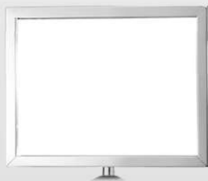
Horizontal 11" X 14" 280mm x 355mm