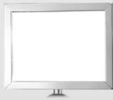
Horizontal 8.5" x 11" 216mm x 280mm