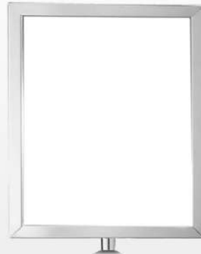
Vertical 11" X 14" 280mm x 355mm