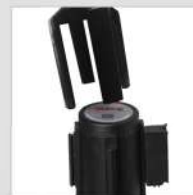
Easy Fit Post Top Adapters for Belt