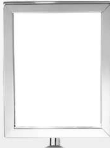
Vertical 8.5" x 11" 216mm x 280mm