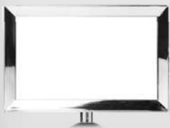
Horizontal 7" X 11" 120mm x 200mm