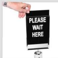
Easy Sign Replacement