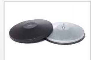
Concrete filled galvanized steel base