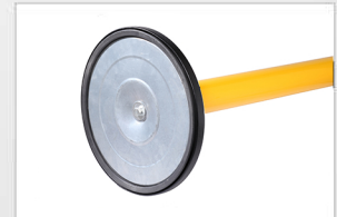
Full circumference floor protector