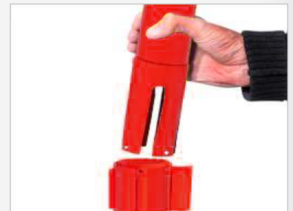
Easy lower cassette replacement