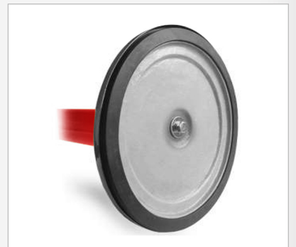
Weatherized cast iron base